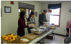
Above & Right: Bellacino's Christmas Eve meal