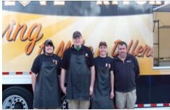
Above: Little Caesars of Findlay & the 'Love Kitchen' truck